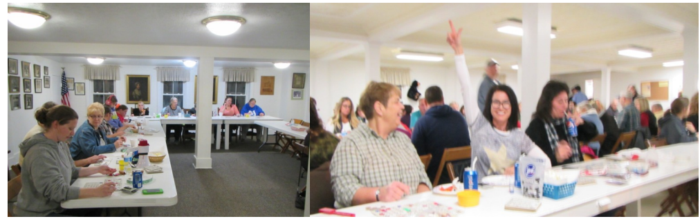
Scenes from the Parkman Fire and Rescue Fall 2016 Feather Bingo Fundraiser Thanks to all who continue to support our event!

If you have any concerns, questions or feedback positive or negative, please feel free to